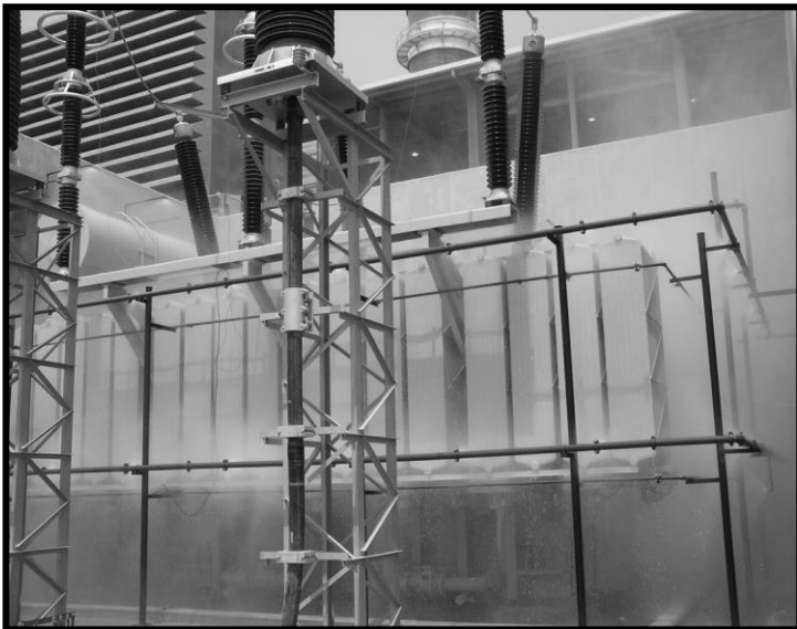
HVWS - TRANSFORMER PROTECTION SYSTEM