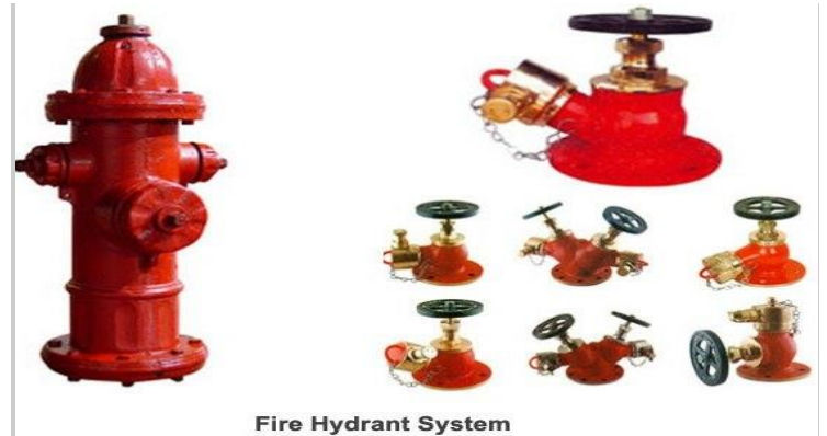
Fire Hydrant System