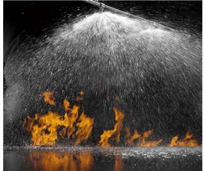
FIRE SPRINKLER SYSTEM