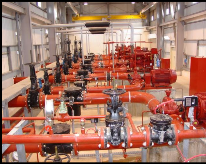
FIRE PUMP ROOM ARRANGEMENT